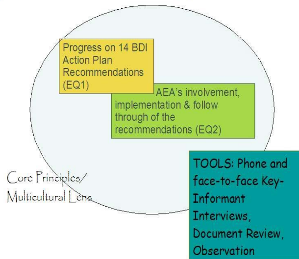
Figure 2. AEA BDI Evaluation Plan for Phase I

Finally, a third evaluation question was assessed based on a process of developing and assessing the findings based on a series of customized conceptual frameworks that provide insight into the depth of AEA’s commitment to the BDI and cultural competency. Evaluators considered: attributes of the key actors in the BDI, the intentions driving and motivating members and staff to promote the BDI and principles related to the value of multiculturalism/cultural competency. Figure 2 shows a visual representation of the Evaluation Plan and how the exploration of questions interrelates with the “lenses” used to understand the findings. These lenses have been described above and include the core principles framework, which is summarized as the two BDI imperatives – justice and excellence – and the four step framework to assess multiculturalism.